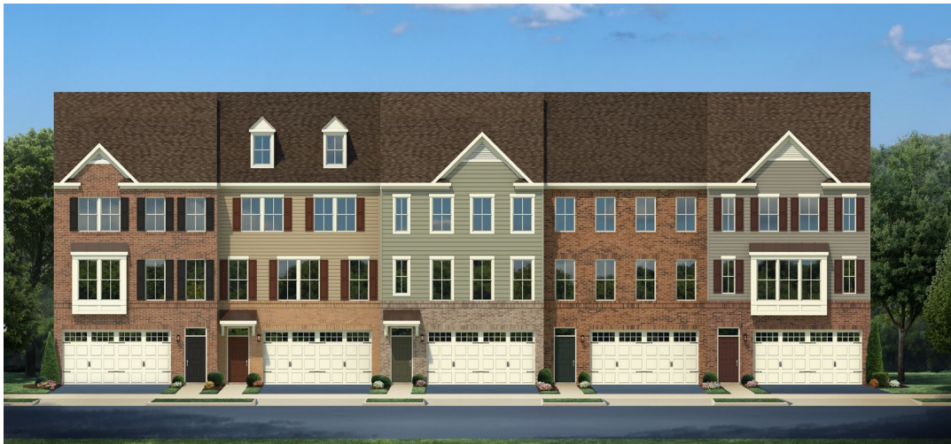
Figure 2: Proposed Architectural Elevations – Front-Load Garages