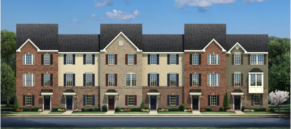
Figure 1: Proposed Architectural Elevations – Rear-Load Garages