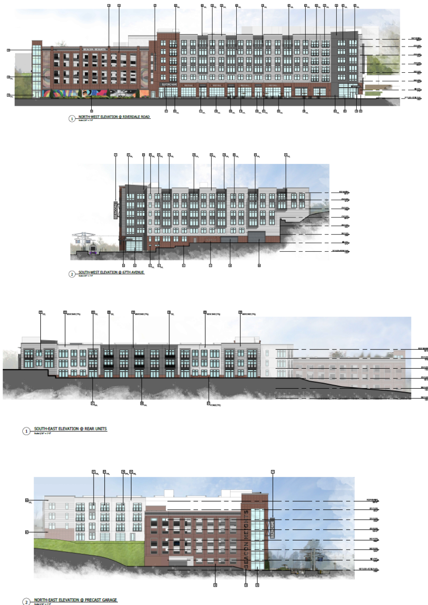
Figure 2: Building Elevations

lighter gray panels. This treatment adds visual interest to the design. The parking garage includes a well-defined corner stairwell at its northeast corner with ample fenestration. Brick veneer will clad the northern façade of the garage and wrap around the stairwell at its northeast corner. The eastern and southern facing sides of the garage will be clad with brick-toned cementitious panels. Large-scale graphics with the wording “Beacon Heights” is provided at the top of the northern face of the garage and on the side of the garage stairwell facing 67th Place. Additional painted graphics are shown along the lower level of the garage fronting Riverdale Road. These graphics are considered public art features that add visual interest to the development, surrounding neighborhood, and new Purple Line station.