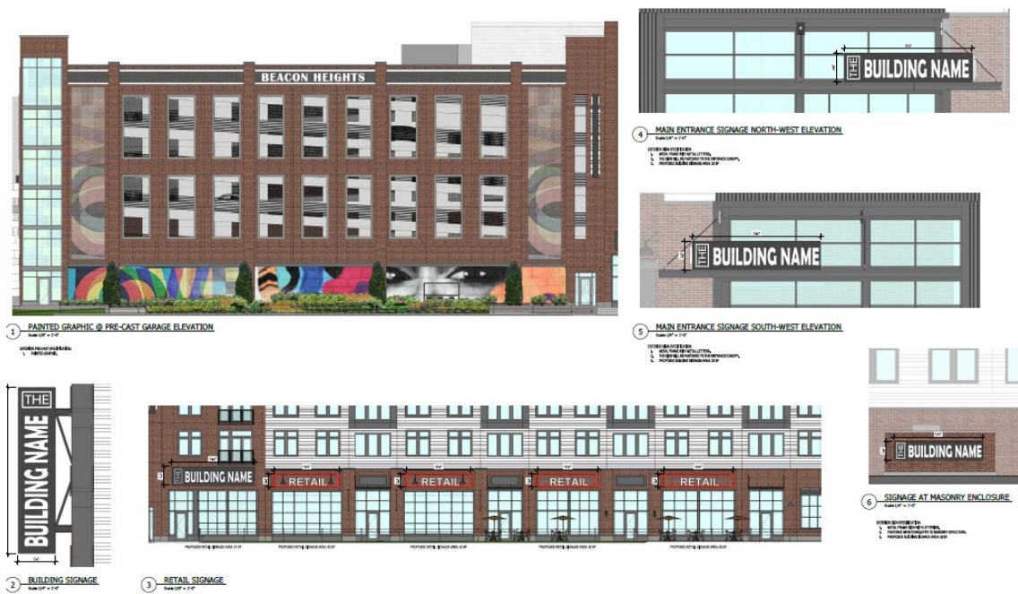
Figure 3: Signage Examples

In accordance with Section 27-441(b), Residential Use Table, Footnote 131, of the Zoning Ordinance, the DSP does not need to demonstrate conformance with Part 12 of the Zoning Ordinance, and signage area calculations were not provided for review. No signage is shown at the rear entrance to the building, adjacent to the dog park. Staff recommends the applicant consider adding a small building-identity sign proximate to the rear building entrance. Given the scope and scale of the project and its prominent location adjacent to the future Beacon Heights-East Pines Purple Line station, staff recommends that with the aforementioned consideration, the signage program provided is acceptable for the proposed development.