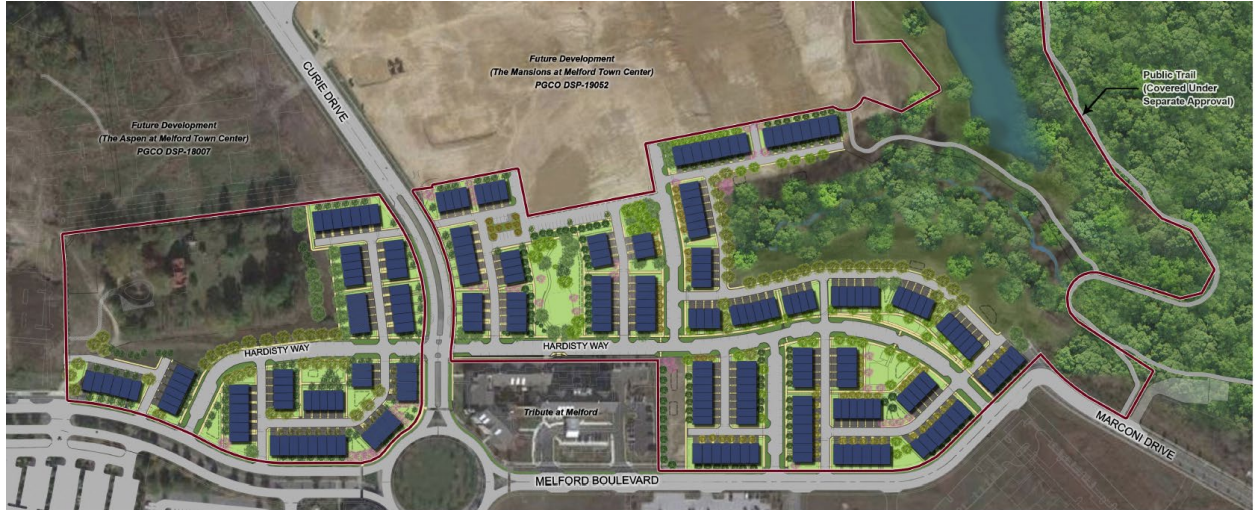
Figure 1: Site Plan

on Parcel AA, connecting the development to the master plan trail along the Patuxent River. Due to the size of the community and the development of a mixed-use town center, it is recommended that the applicant provide residents with an outdoor space for their pets. This could be a dog park with the appropriate facilities and a water source, or at a minimum, the installation of waste bags on the pedestrian trail. Conditions related to providing a dog park and the timing for construction of recreational facilities have been included herein.