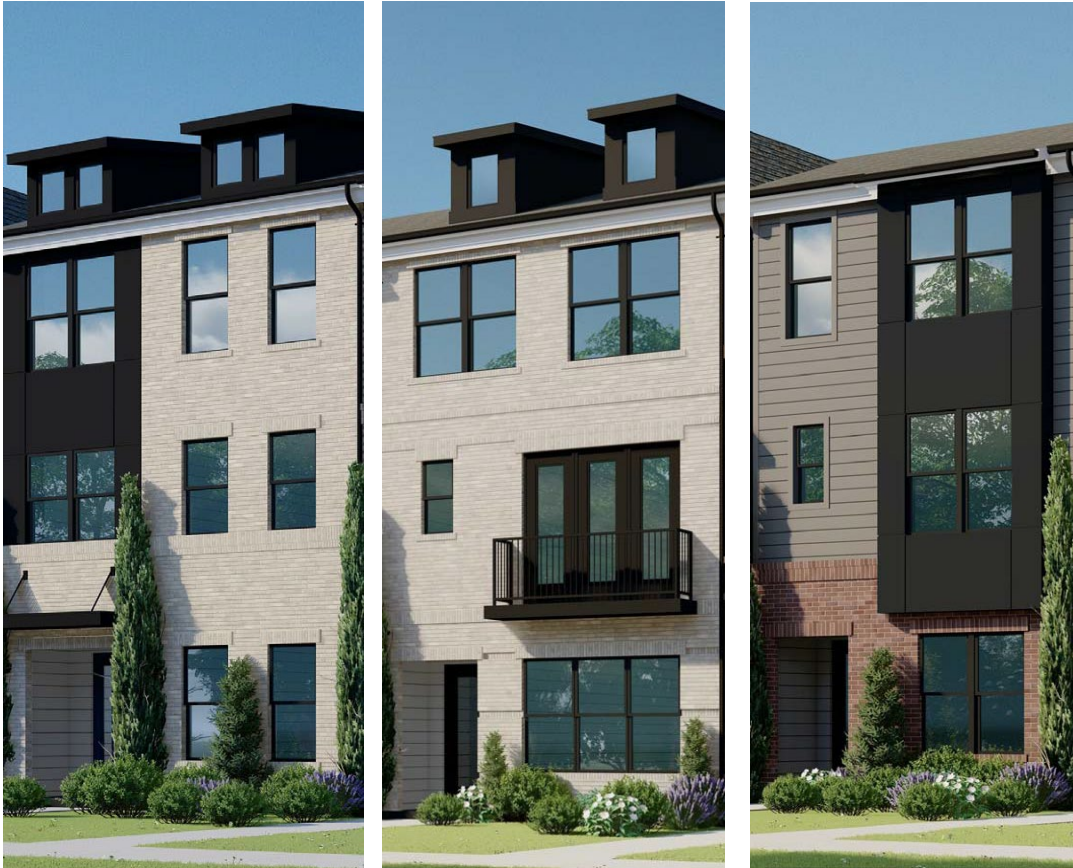
Figure 2: Architectural Elevations

architectural features creating a balanced fenestration. Elevations that will be visible from the Melford House will include the same architectural features and a full brick façade. Conditions related to the treatment of dwellings, highly visible units, and units visible from the historic Melford House are included herein.