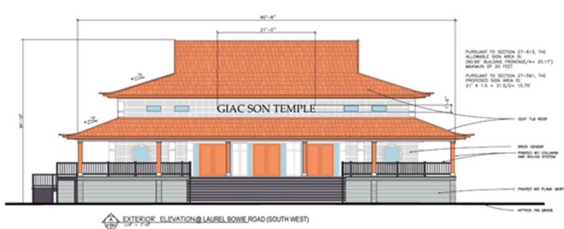
Figure 1: Architecture Elevations

Staff find the proposed architecture to be sufficient, subject to conditions. These include revising the height of the proposed building labeled as Site Note 25 on the DSP coversheet to match the height provided on the architectural elevations; providing dimensions of the proposed building entrances; providing floor plans of the proposed place of worship; providing the material and colored elevations of the Buddha statue and courtyard; and labeling the elevation facing Snowden Road as a side elevation on the architectural elevations and Site Note 26 on the DSP coversheet.