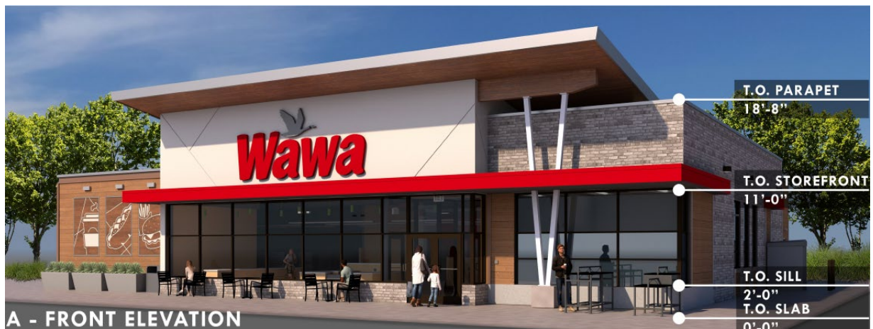
Figure 4: Architectural Perspective of the Food or Beverage Store Building

The building footprint for the proposed food or beverage store is in rectangular shape. The architectural design of the building follows the contemporary trend. The building roof is flat except for an angled, cantilevered roof located in the front and rear of the building that will project approximately 5 feet above the parapet, to create variations of the roofline and define the building entrances. The building is finished with a mix of materials, including brick, composite wood siding, stucco, and concrete panel. Reflecting the cantilever roof at the building entrances featured on the food and beverage store, the canopy that covers fuel islands is also designed to be angled, wing-shaped, approximately 25 feet in height. With increasing concerns of climate change, staff recommend the applicant explore alternative energy resources by adding solar panels to the canopy of the gas station.