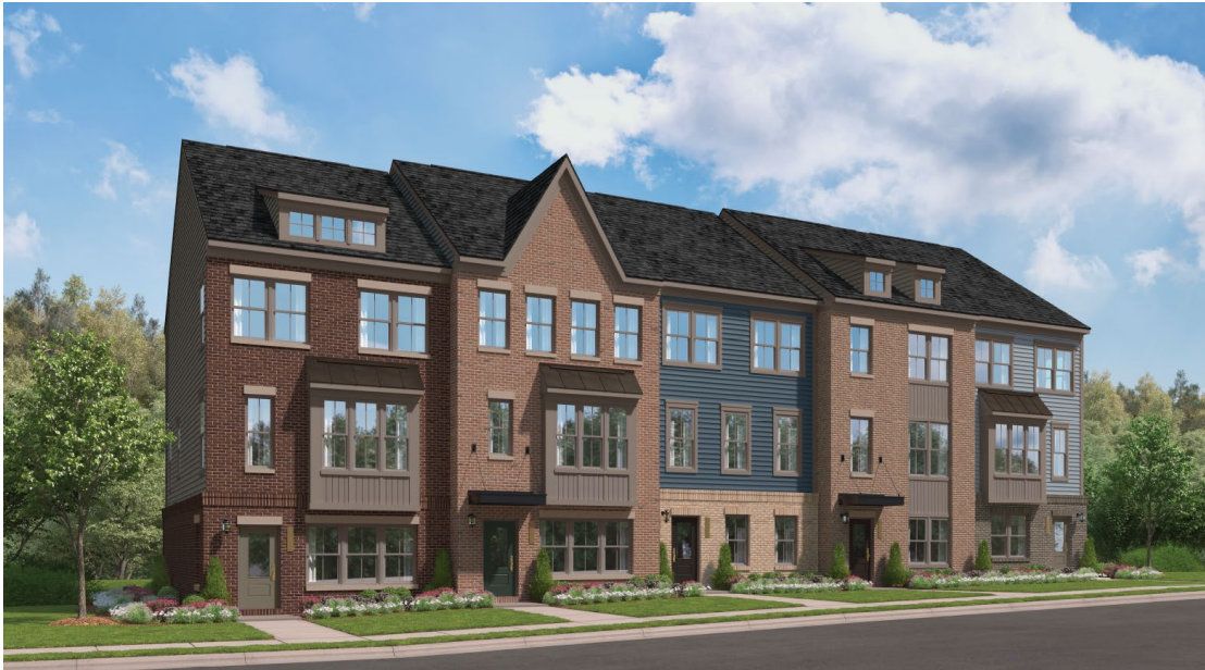
Figure 2: Architectural Perspective of the Jenkins Model

and will be used for those townhouse units fronting Brandywine Road, for compatibility with the Mary Surratt House across the street. The other five building elevations are designed to incorporate a mixture of brick and siding, which are arranged vertically or horizontally, to create a clean and contemporary design. A condition is included herein requiring the applicant to clearly label the siding materials on the architectural elevations. In addition, highly visible lots are indicated on the submitted plans and noted in the brick track chart. The submitted architectural package includes high visibility side elevations for the proposed townhouse models, with additional windows or architectural features.