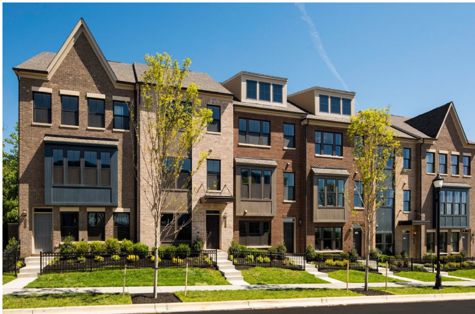
Figure 3: Architectural Perspective of the Parker Model