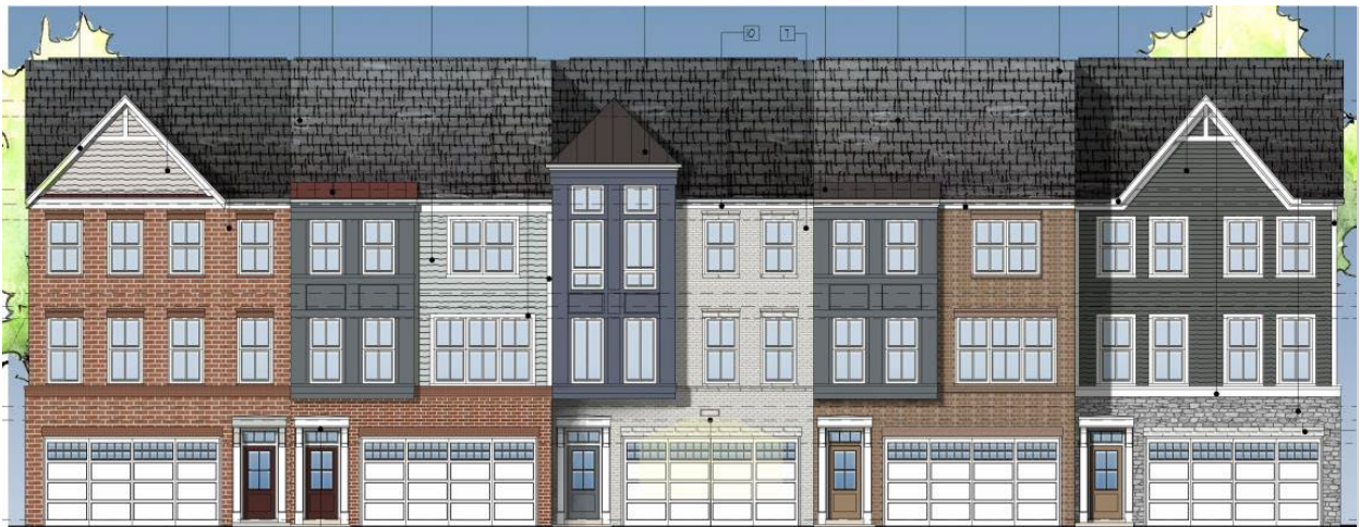
Figure 3: Gunston Model 3-story: 24' x 34' Two-Car Front Load Garage