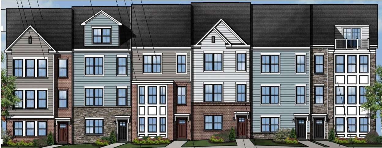
Figure 2: Cameron and Carlyle Models 3-story: 20' x 40' Two-Car Rear Load Garage