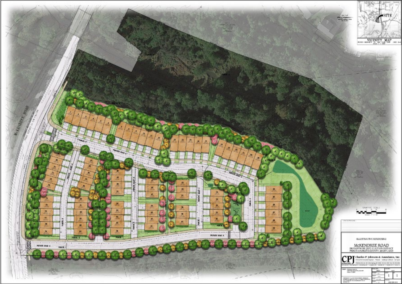
Figure 1: Illustrative Site Plan

Streets), of the 2018 Prince George’s County Landscape Manual (Landscape Manual), and a Type 2 tree conservation plan (TCP2). The applicant requests two waivers under Section 27-6200 of the Prince George’s County Zoning Ordinance. First, under Section 27-6207(b)(2), they seek a waiver from the requirement in Section 27-6207(b)(1), to provide a pedestrian walkway cross-access between developments. Second, under Section 27-6208(b)(2), they request a waiver from the requirement in Section 27-6208(b)(1), to provide an internal bicycle circulation system and for bicycle cross-access between adjoining parcels.