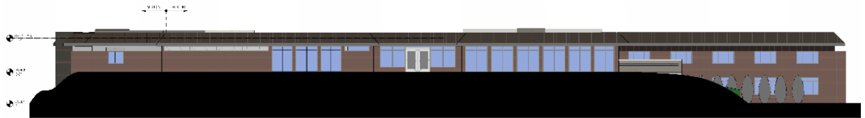
Figure 1: South Building Elevation Facing Marlboro Pike

The subject development will encourage a stronger sense of place, encourage pedestrian access, be compatible with surrounding land uses, and improve the physical appearance of the area as a whole. The two internal gardens provide an enhanced sense of place by providing an enhanced open space at the center of the property.