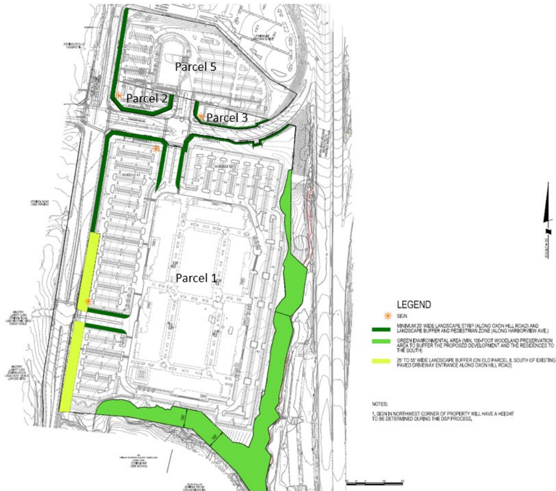
Figure 1: Conceptual Site Plan