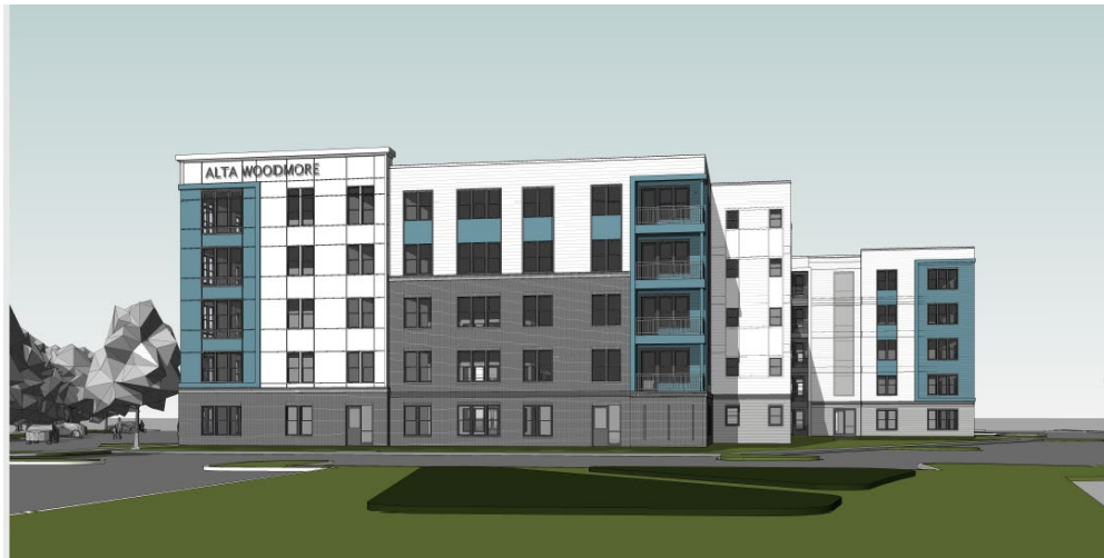
Figure 2: Building 1 – Front Elevation Facing Ruby Lockhart Boulevard