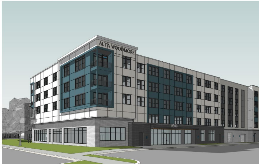
Figure 1: Building 1 – Front Elevation Facing Ruby Lockhart Boulevard