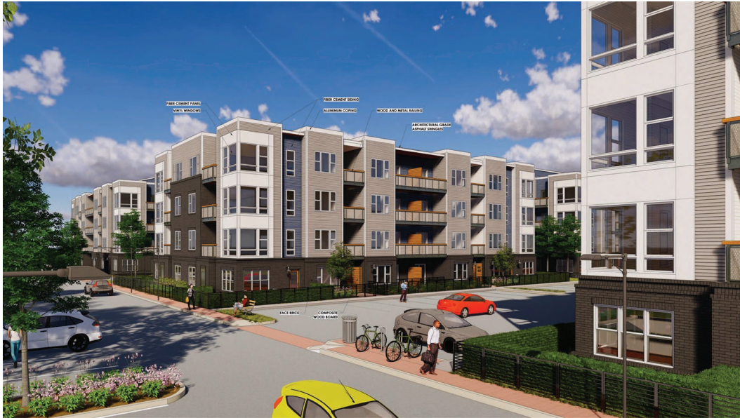
Figure 2: Rendering of Proposed Development