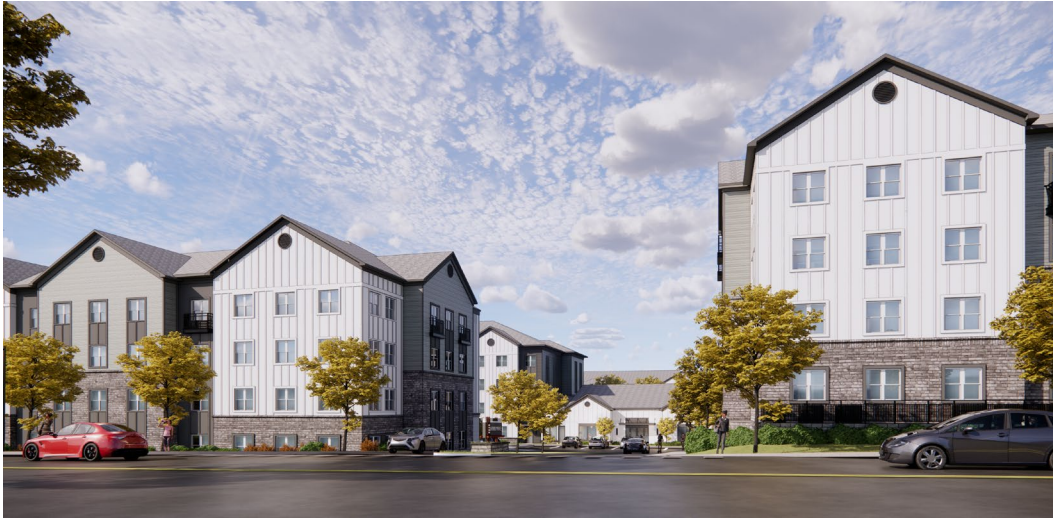
Figure 1: Proposed Matapeake Business Drive Architectural Rendering

metallic fencing separate the façade of Building 2000 from the Matapeake Business Drive streetscape.