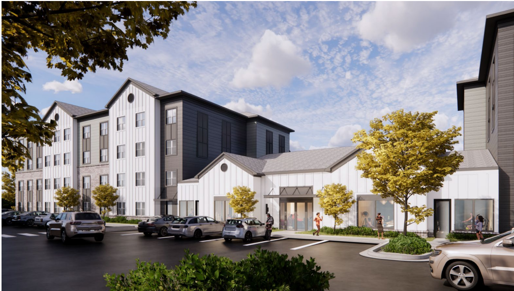
Figure 3: Clubhouse Architectural Rendering