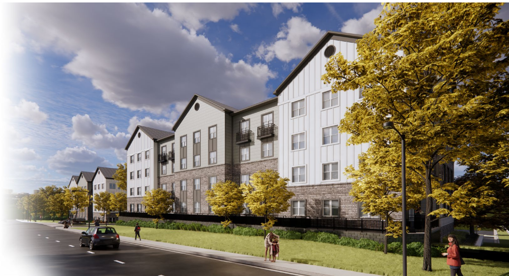
Figure 2: Building 2000 Architectural Rendering