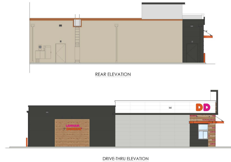
Figure 2: Building Elevations