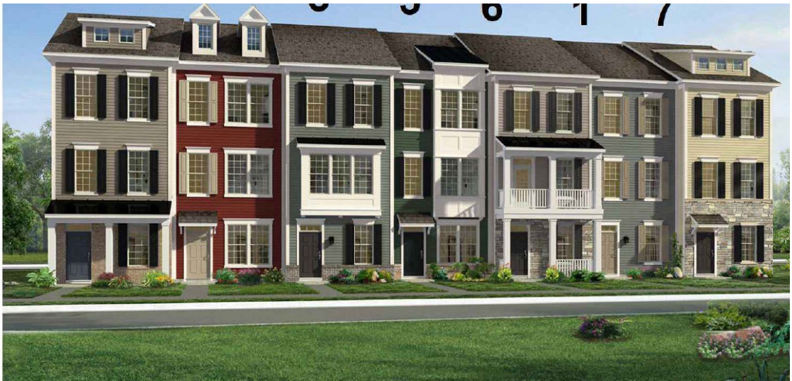
Figure 3: Alden II Elevations

No new signage is proposed with this DSP amendment as there are no new residential entrances and the additional units will be a continuation of the existing community. A photometric and lighting plan were provided showing sufficient illumination for the private streets and minimal spillover from the existing office to the proposed townhouse units.