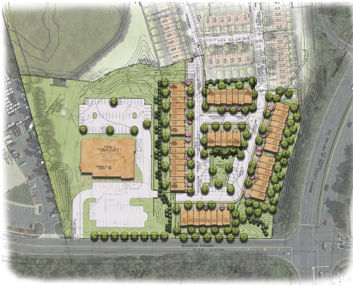
Figure 1: Site Plan

The submitted DSP proposes a 15-foot-wide, gravel, emergency-access path between the office parking lot and nearby private residential streets. On-street parking is also shown in several locations. On-site recreational facilities for the expanded residential community will include a plaza/pocket park that is integrated with the linear park/bicycle trail, which has been created to be the focal point of the entire development.