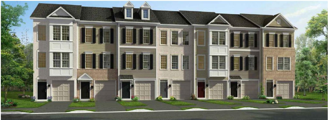
Figure 2: Edson II Elevations

the proposed townhouses should have full front façades of brick, stone and/or stucco and a brick tracking chart is included on the cover sheet to ensure this.