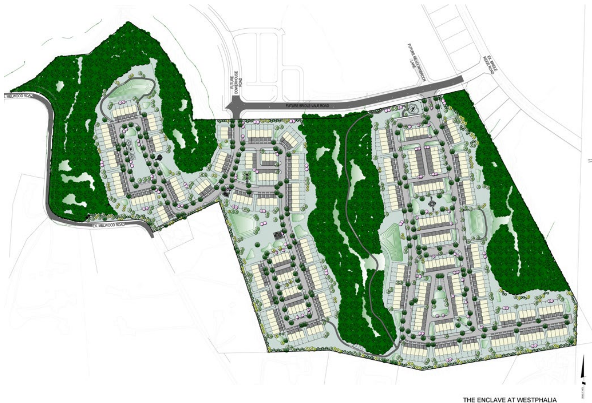
Figure 1: Illustrative Site Plan