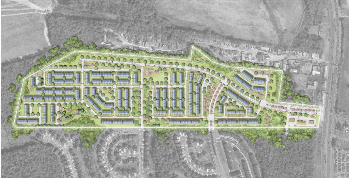
Figure 1: Illustrative Site Plan

CSP-18003 in the eastern portion of the site. On-street parking will be provided on internal streets, near recreational facilities, and within driveways and garages for all residential units.