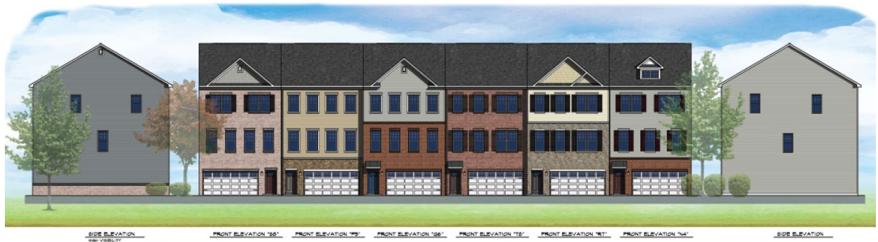
Figure 2: Proposed Townhouse Elevations