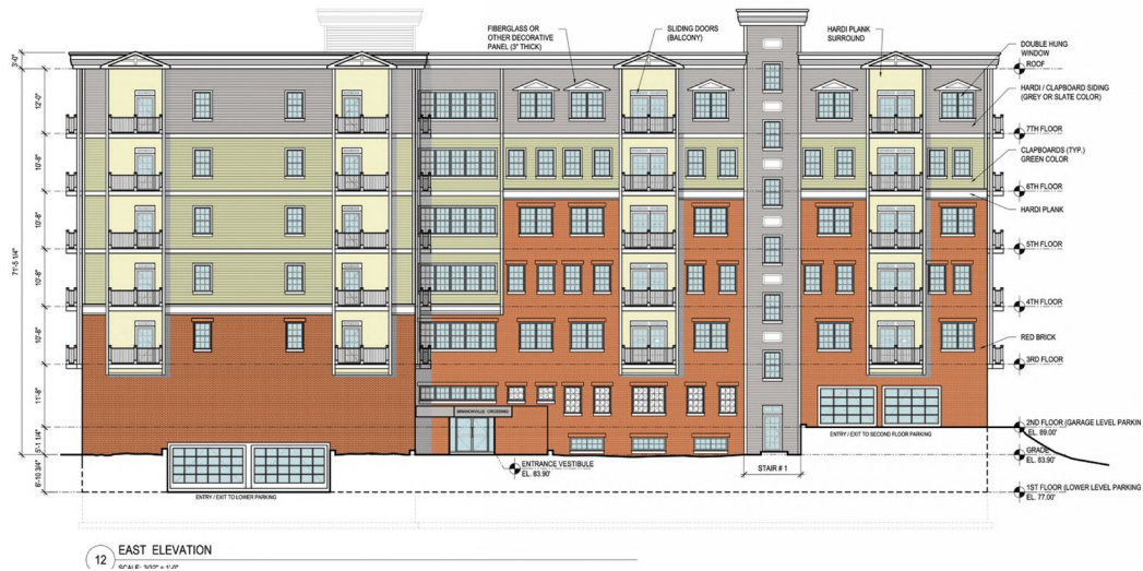
Figure 2: Proposed West and East Elevations