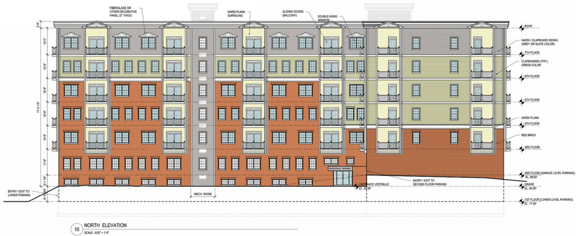
Figure 1: Proposed South and North Elevations