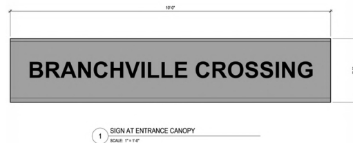
Figure 4: Permanent real estate sign

One building-mounted sign is shown above the main entrance to the building, and a detail has been provided by the applicant. The applicant states that this is a permanent real estate sign and meets the regulations of Section 27-618(c) of the Prince George's County Zoning Ordinance.