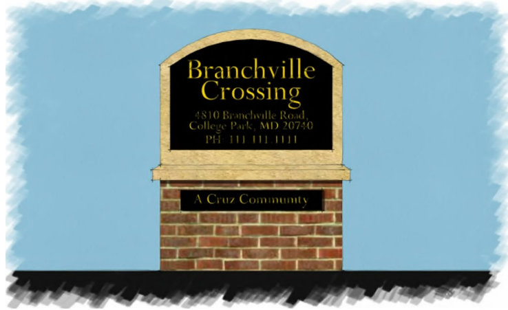
Figure 3: Proposed Freestanding Sign

The DSP includes one 4-foot-high, double-faced monument sign along Branchville Road, near the entrance to the site. The sign is constructed of stone and is mounted on a brick base matching the architecture of the multifamily building. The externally illuminated sign proposes up-lighting and displays the name and address of the development in raised gold letters on a dark background. The 3-foot-wide sign does not include landscaping at its base, which is conditioned to be added to provide seasonal interest.