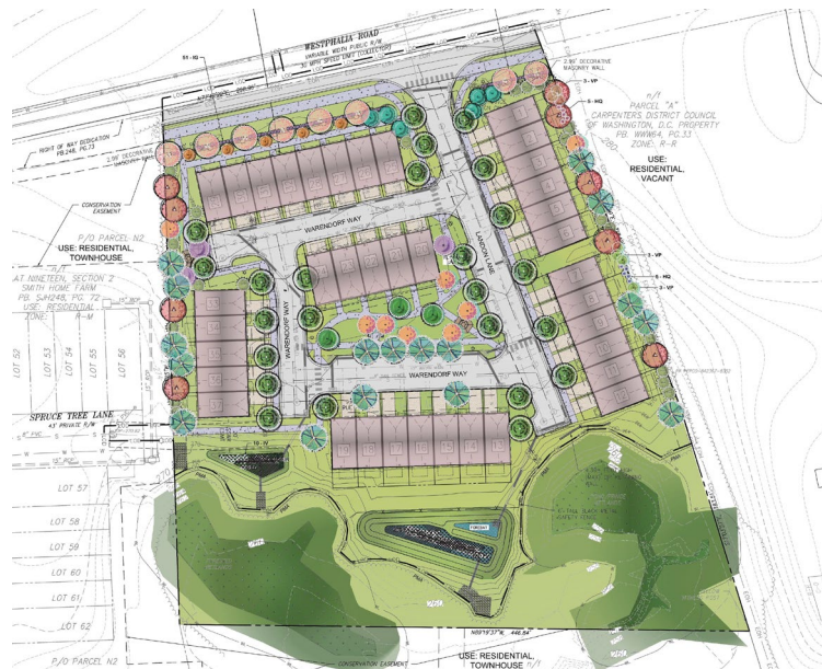
Figure 1: Illustrative Plan

The proposed recreational facilities will include a central greenspace, two gazebos, on-site trails, and a sitting area for the residents of the Heppe Property. The details of the recreational facilities are included with this DSP, and staff finds them acceptable. The timing for the completion of construction and installation of the proposed recreational facilities has been included in the Recommendation section of this report.