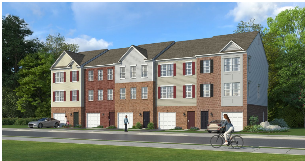
Figure 2: Nash Elevations

Highly visible side elevations are shown on the building elevations submitted, but have not been identified on the DSP. The highly visible units should include a minimum of three standard features, in addition to a full first floor finished in brick, stone, or masonry. The plan should be revised to label the additional specified lots as highly visible. It is also recommended that no two units located next to or across the street from each other have identical front elevations. Conditions have been included in the Recommendation section of this report, in accordance with these issues.