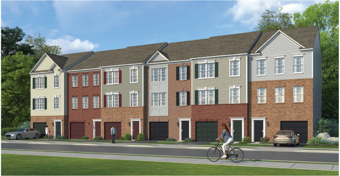
Figure 3: Lafayette Elevations