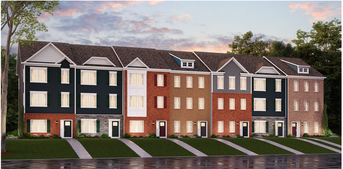
Figure 4: Columbus Elevations