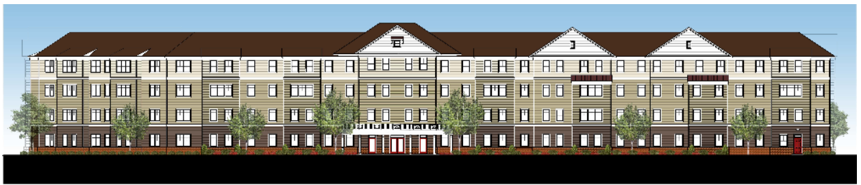
Figure 2: Senior Apartments, North Elevation

The residential buildings will be four stories, composed of a combination of brick, cementitious siding, and vinyl. Each building will include a leasing office, community room, computer room, and indoor bicycle storage. The senior apartment building will have a game room and the multifamily building will have a fitness center. The main entrances to the buildings are centrally located with an entrance facing Mimosa Avenue and Woodyard Station Road, as well as entrances in the rear facing the parking lot. The entrances to both buildings on the road frontage are articulated by a projecting building section and a covered entryway. The central building section is capped with a more prominent gable end with windows and an awning. The multifamily building further accentuates the entry with a 2-story course of brick on the frontage that extends from a brick watertable. The buildings are proportionally divided into smaller forms to minimize visual impact by providing recesses across the front and rear façades, multistory box window projections, mixed materials and color patterns by section and floor, and gable end enhancements along the roof line. The multifamily building scales down to a narrower width and to three stories on each end. This will reduce the dominance of the structure at the western property line, providing a softer transition to the adjacent, R-80-zoned, vacant property.