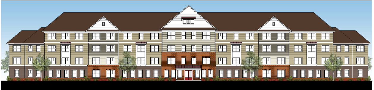
Figure 3: Multifamily Units, North Elevation