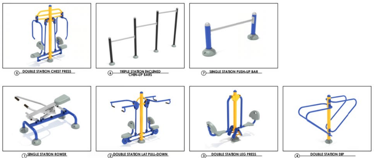
Figure 2: Gym Equipment Details