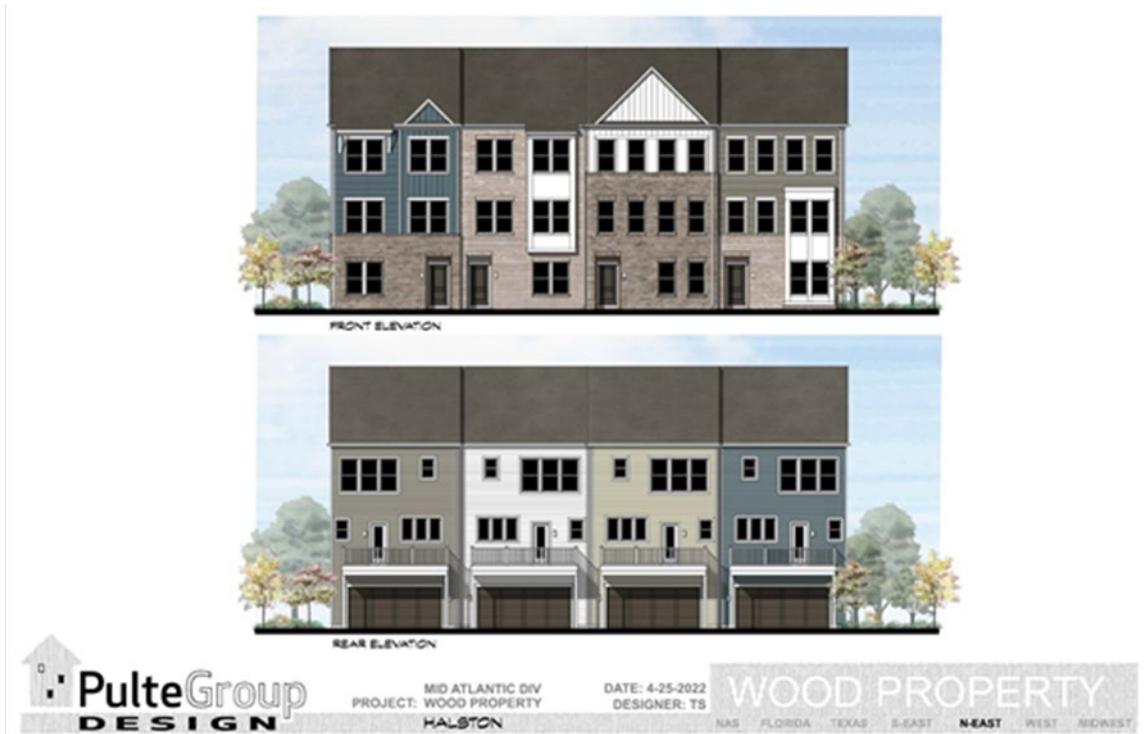
Figure 2: Halston rear-loaded 22-foot-wide townhouse unit