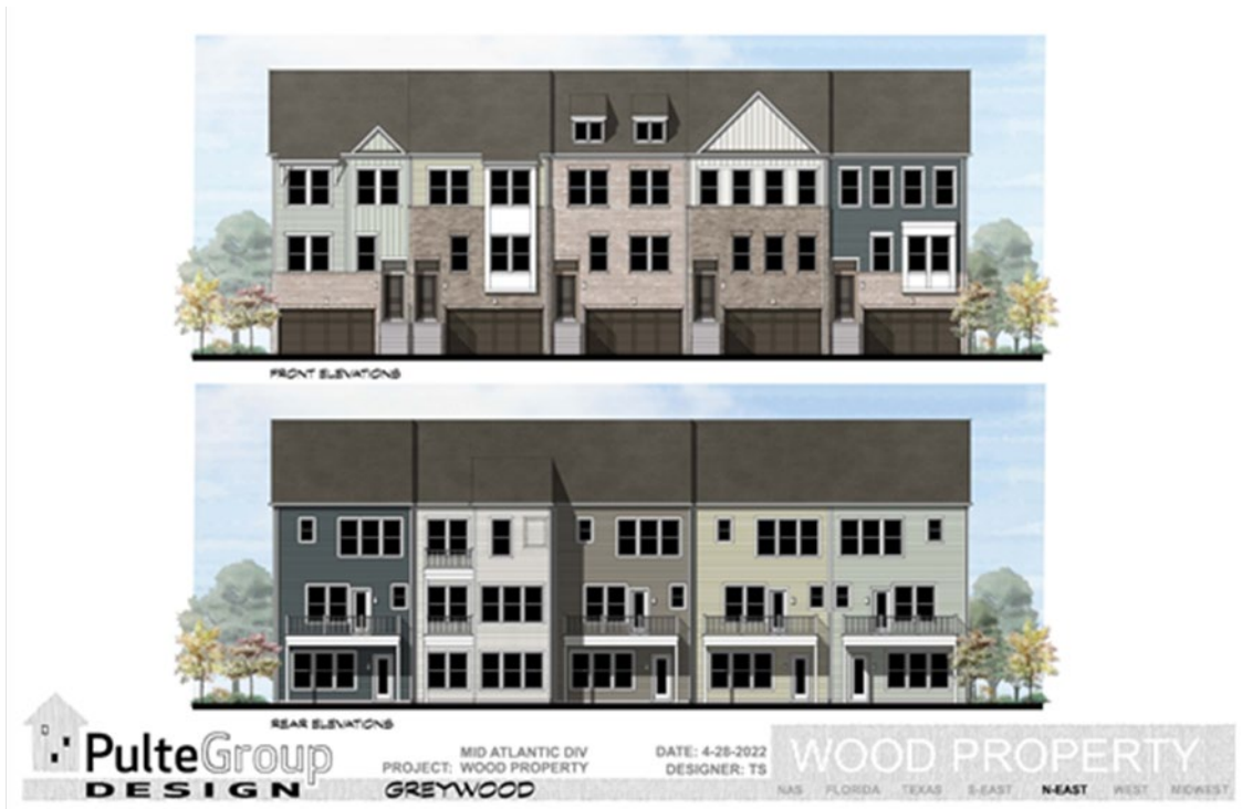
Figure 1: Greywood front-loaded 22-foot-wide townhouse unit.