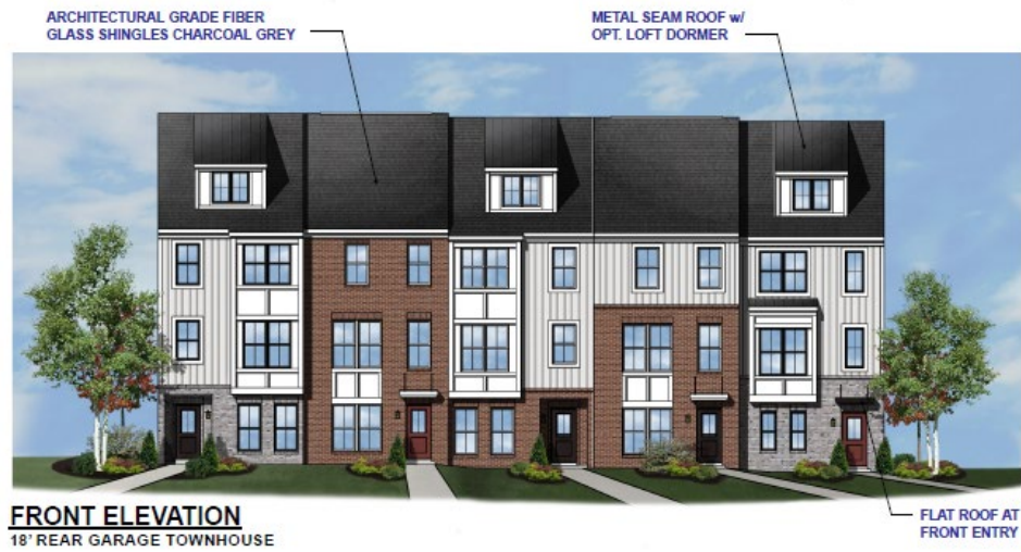
18-foot-wide Model Front Architectural Elevation

masonry. Conditions have been included in this technical report, in accordance with these issues.