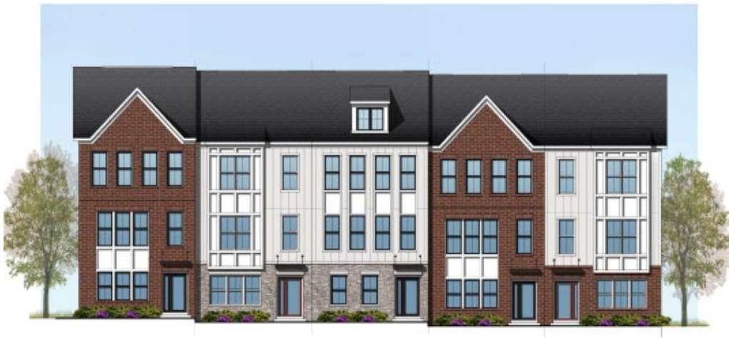
20-foot-wide Model Front Architectural Elevation