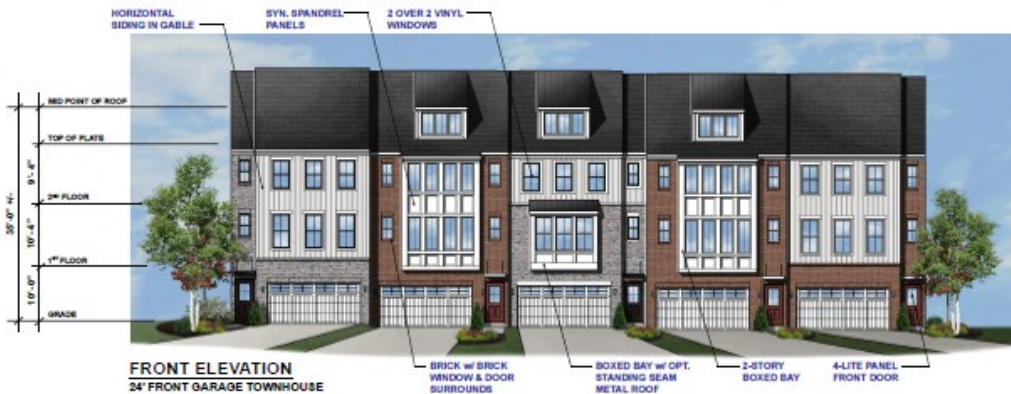
24-foot-wide Model Front Architectural Elevation