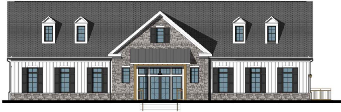
Figure 3: Front Elevation of Community Building (Clubhouse)

The subject SDP also includes the architectural elevations of the proposed community building (clubhouse). This building is located at the southeast quadrant of Leeland Road and Leeland Knoll Parkway. The building is approximately 20 feet in height. The design of the building roof is a gable roof, covered with architectural shingles. The building façades are finished with a mix of materials including fiber cement siding, brick veneer, glass and metal. Other architectural details include shutters, gable louver, entrance porches, and a stainless steel cable trellis system. A condition is included herein requiring the applicant to clearly label building façade materials on the elevations of the proposed clubhouse.