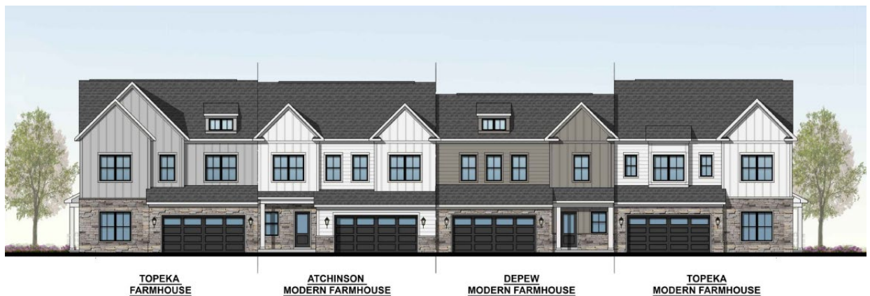
Figure 1: Front Elevation of Single-Family Attached Carriage Homes

Six single-family attached lots, which are shown on the coversheet of the architectural set (Sheet Arch-000), are identified to be high-visible lots. They are Lots 63, 65, 66, 88, 89 and 112. A condition is included herein requiring the applicant to note these lot numbers on the coversheet of the submittal (SDP-001).