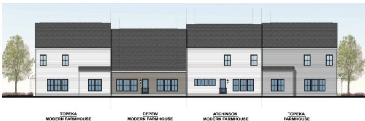
Figure 2: Rear Elevation of Single-Family Attached Carriage Homes