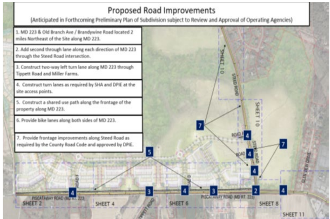
Map 1: Location of Proposed Improvements

Staff find the proposed improvements to be a public benefit that will help further mitigate traffic circulation in the surrounding neighborhood. If this application is approved, further evaluation will occur at the PPS stage of development.