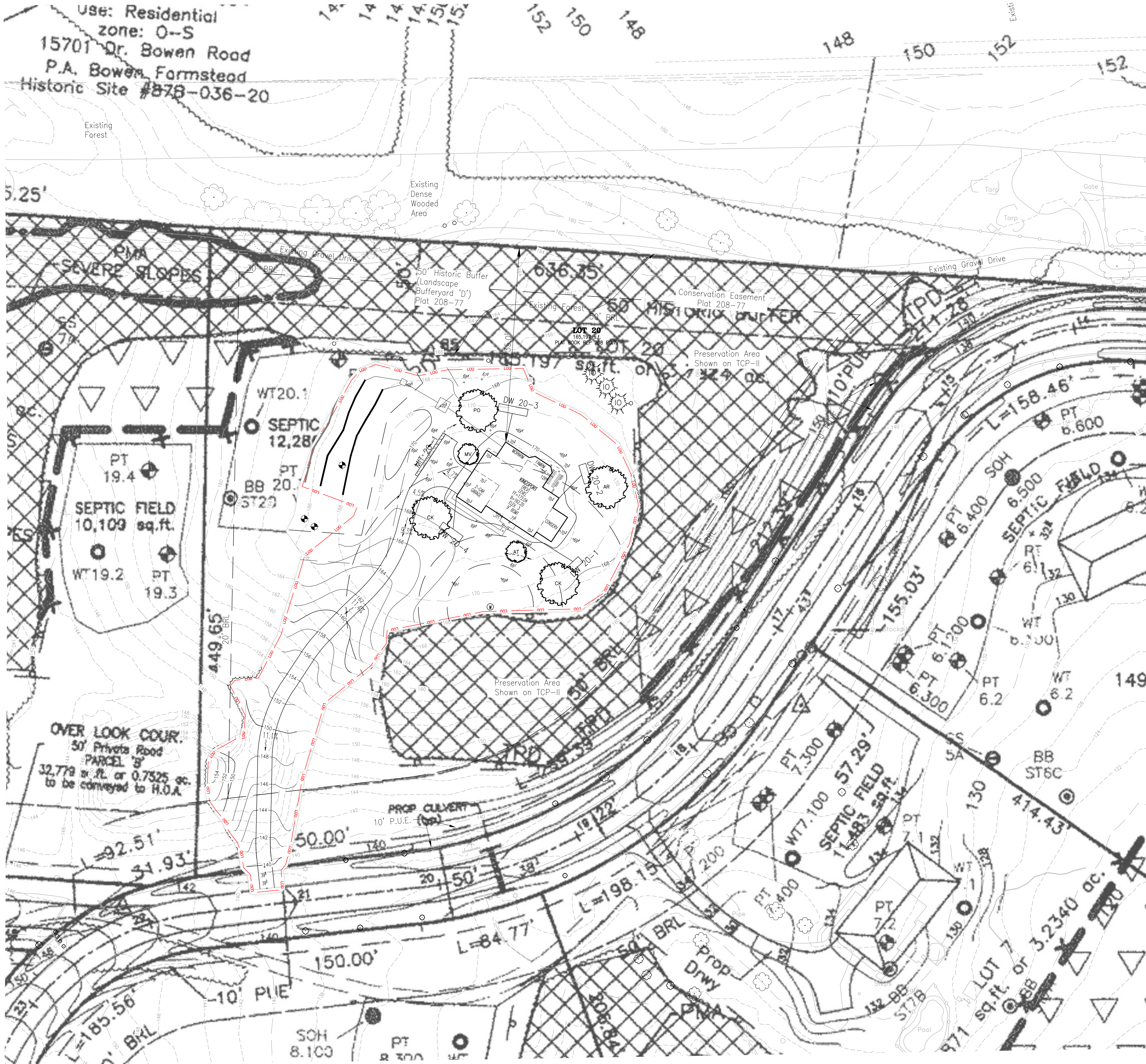
SITE PLAN ON PREVIOUSLY APPROVED TCP2-059-05-02